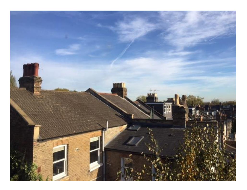
Image 2: Side of rear roofslope of 31 Cressida Road taken from north