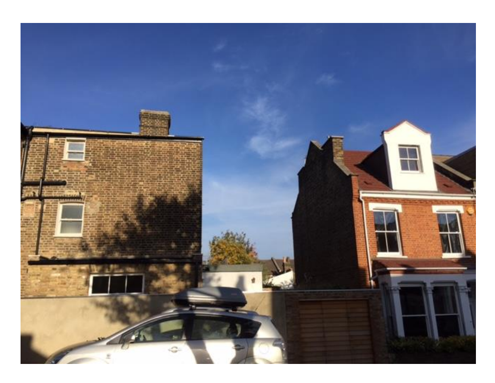
Image 3: Long view of 31 Cressida Road from east from Prospero Road